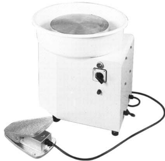
M1 (with optional splashpan)

The Mini-Master is small and compact yet constructed for durability. It features a heavy-duty enclosed body to protect all internal parts, keeping them dry, clean and out of reach.