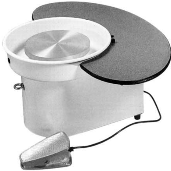
M250, M400, M750 (with optional splashpan and table)

The Master is engineered with excellence for an ideal concept that produces remarkable power combined with extremely smooth speed adjustment. The ideal is achieved by using state-of-the-art components, such as: