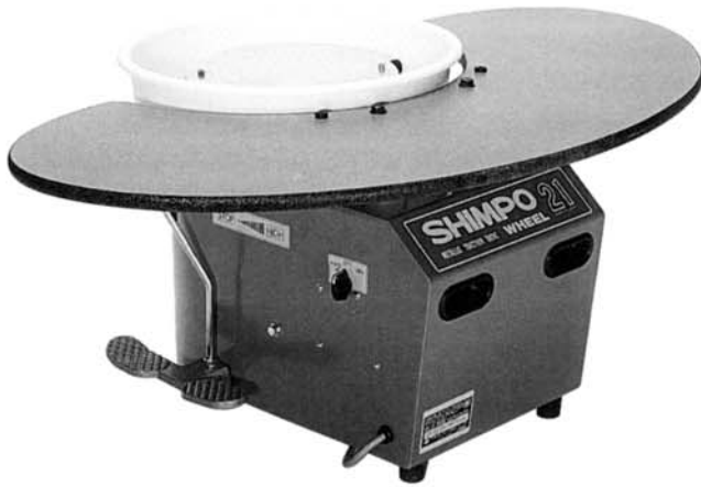
RK-10 (with optional splashpan and table)

At the heart of the wheel is our patented RX infinitely-adjustable speed drive system that multiplies power automatically. As speed is reduced, torque is increased up to 700%. The pure traction design allows the full-rated power of the motor to be transmitted through a rolling motion—no gears or sensitive electronic control circuitry! No need for more horsepower!